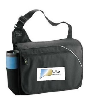
HRLA Urban Messenger Bag & Mug 100% Recycled Material Imprinted with the HRLA Logo