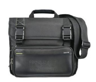
HRLA Ecosmart Bag 13" Recycled Tablet Bag Embossed with the HRLA Logo