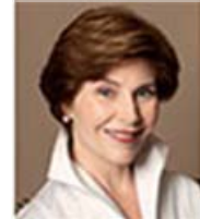
Closing General Session Featuring: Laura Bush