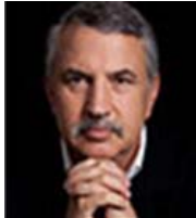
General Session Featuring: Tom Friedman