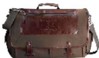
HRLA Classic 20" Weekender Bag Embossed with the HRLA Logo

If your HR friend or colleague types your name on the HRLA Website Application , “How did you hear about HRLA?” & then they JOIN HRLA, you may choose a Referral Gift .