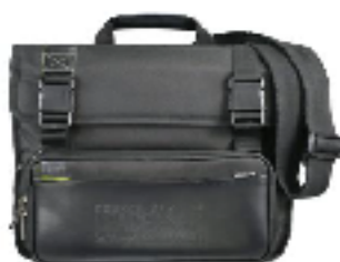
HRLA Ecosmart Bag 13" Recycled Tablet Bag Embossed with the HRLA Logo