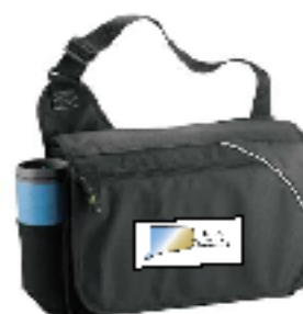
HRLA Urban Messenger Bag & Mug 100% Recycled Material Imprinted with the HRLA Logo