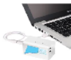
HRLA Energy Bar Pro 8,400 mAh Imprinted with the HRLA Logo